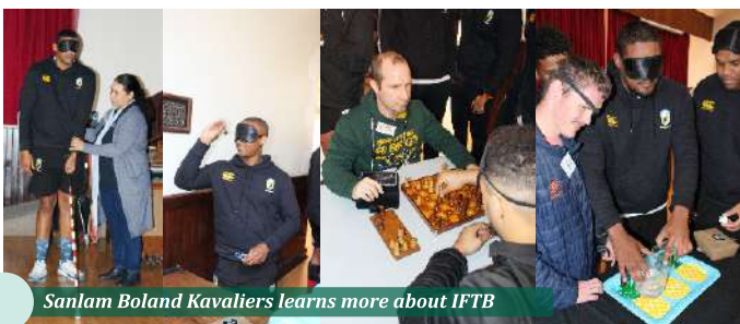
Sanlam Boland Kavaliers learns more about IFTB