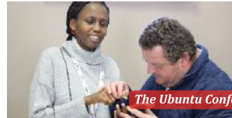
The Ubuntu Conference's visit to learn more about IFTB