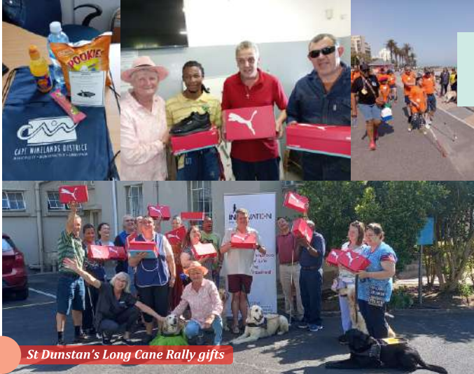
St Dunstan's Long Cane Rally gifts