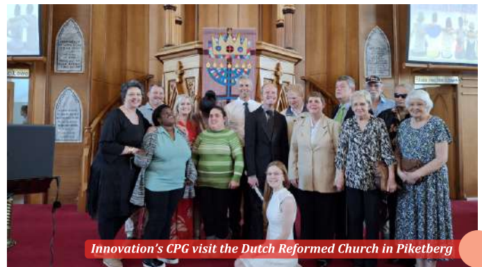
Innovation's CPG visit the Dutch Reformed Church in Piketberg