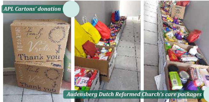
APL Cartons' donation

Your donations made the festive season special for all the families in our care.