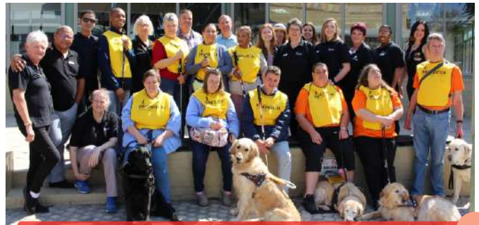
Participants of the Mall Walk in Worcester Mountain Mill Shopping Centre