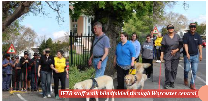
IFTB staff walk blindfolded through Worcester central

In addition, we shared weekly tips on our social media. Various optometrists offered free screening tests throughout the month: Many thanks to Van Eeden & Le Roux Oogkundiges, Rejeanne Dippenaar Optometrists and Torga Optical.