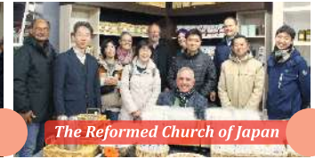
The Reformed Church of Japan