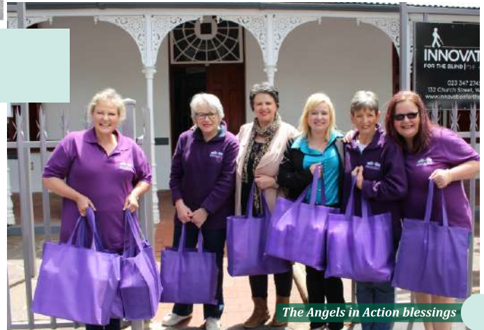
The Angels in Action blessings

We had the privilege of welcoming five "angels" from Angels in Action on 29 October to learn more about our organisation. They had the opportunity to experience what it means to live with blindness or visual impairment and how our residents overcome the challenges of everyday life. At the end of the visit, they blessed our residents with bags full of love and care in the form of toiletries. We appreciate it!