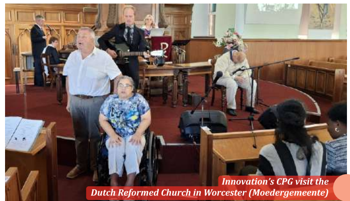
Innovation's CPG visit the Dutch Reformed Church in Worcester (Moedergemeente)