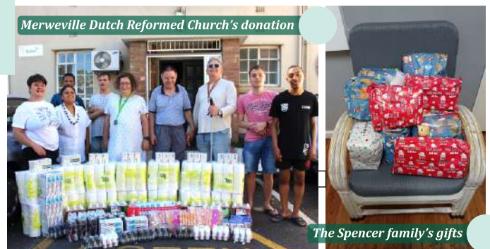
Merweville Dutch Reformed Church's donation

A big thank you to the following donor friends: the Merweville Dutch Reformed Church for the