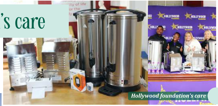
Hollywood foundation's care

The Hollywood Foundation blessed us with a very valuable donation of urns and blood pressure monitors. We would like to say a big thank you for this great donation.