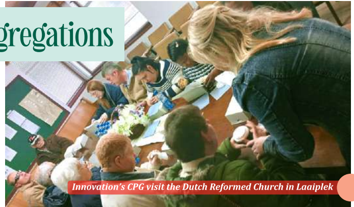
Innovation's CPG visit the Dutch Reformed Church in Laaiplek