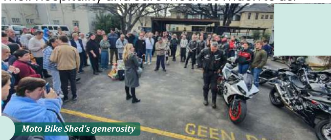
Moto Bike Shed's generosity

The Sanlam Boland Kavaliers rugby players thoroughly enjoyed their visit to IFTB. They participated in various activities – all blindfolded – to experience what it is like to be blind. The players walked with long canes, played darts and chess, learned how to identify money, pour a glass of water,